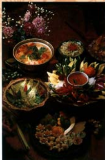
Traditional Thai cuisine