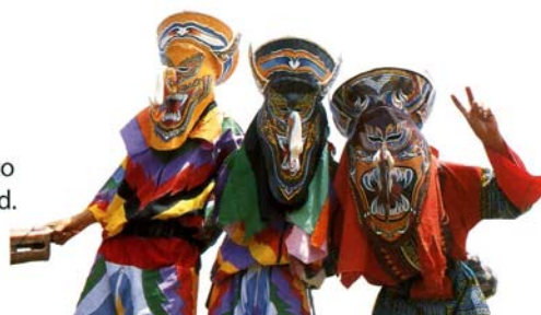
Phi Ta Khon, LOEI

Continuing Education credits shall be awarded to interested delegates by the Pharmacy Council, Thailand. (CPE 7.9 credits)