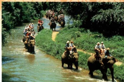
Elephant riding, CHIANG MAI