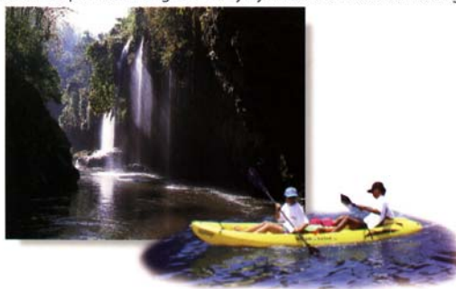
Thi Lo Le Waterfall, TAK