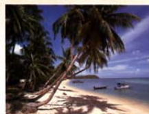
Ko Samui, SURAT THANI