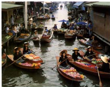
Damnoen Saduak Floating Market, RATCHABURI

The Annual Research Conference organized by the Faculty of Pharmaceutical Sciences, Chulalongkorn University has been initiated since 1982 and has traditionally been included as part of the Faculty's annual events. This annual event has become a well recognized and the expected research event among the nation pharmaceutical researchers. It has been arranged annually in December. The purpose of the conference is for researchers in every pharmaceutical sector and field of interest across all regions of Thailand to share their current research pieces with their peers. With the increase in the number of interested researchers and research papers, the format of this conference has been changed from all podium presentations in the past to a few invited speakers and poster presentations. All of the accepted abstracts will be published in the special issue of the Thai Journal of Pharmaceutical Sciences distributed to every participant. This annual event is intended to update research community on contemporary research issues as well as research advances. The content of the conference is therefore tailored according to the research milieu.