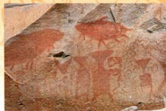
Pha Taem, UBON RATCHATHANI